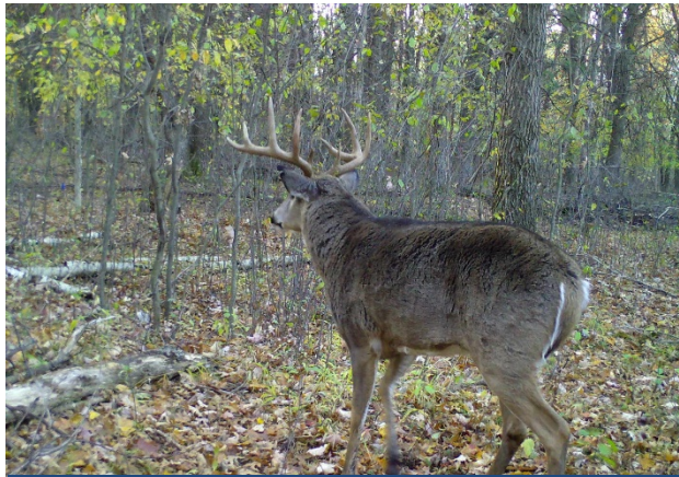
Snapshot Wisconsin: There are more than 1000 trail cameras throughout the state hosted by citizen volunteers. The data is used by the WDNR for species management plans. This buck was captured by the camera in Schmeckle Reserve in 2019.