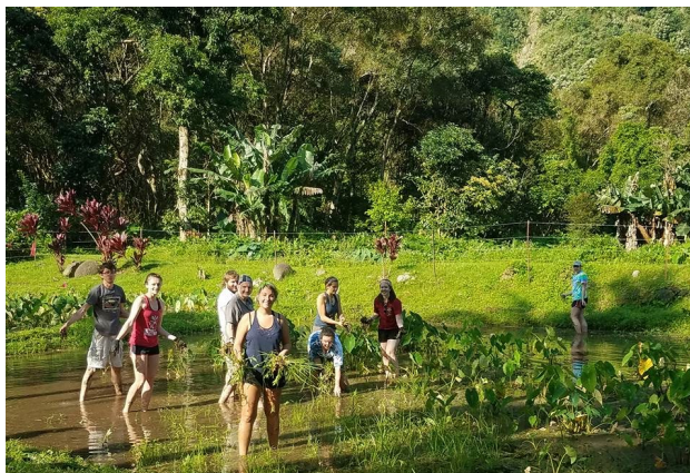
UWSP students work in a taro patch in the Waipio Valley during a field course to Hawaii in 2017. Your effectiveness as a wildlife biologist will be improved if you are willing to work together with the stakeholders. Sometimes that means getting in the muck.