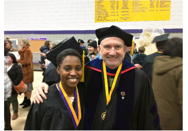
Graduation Day: It’s weird. You’ve been in school since you were six and now you have to get a real job. You’ve been practicing skills the entire time you were in college, but can you communicate those to a potential employer?

Leadership, on the other hand, has dropped from the fourth most sought-after attribute last year to the seventh this year (tied with verbal communication skills). Other highly valued attributes that employers want to see evidence of on resumes this year include analytical/quantitative skills and a strong work ethic.