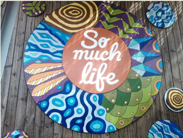
Urban Ecology Center, Milwaukee, WI